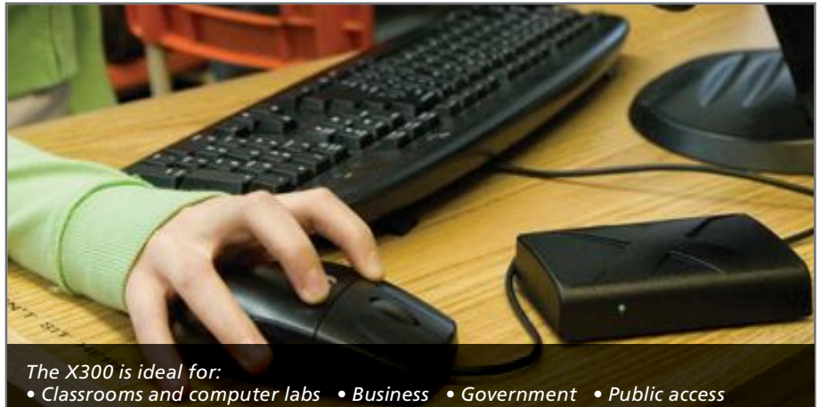
The X300 is ideal for: • Classrooms and computer labs • Business • Government • Public access

NComputing virtual desktops are based on a simple fact: today's PCs are so powerful that the vast majority of people use only a small fraction of their available computing capacity. The X300 taps this unused capacity so that up to seven users can simultaneously share a single PC. Each user gets their own personal computing environment (applications, settings, files, and preferences) , but at a fraction of what it would cost to deploy individual computers. So even though seven people share a single system, they each get their own rich PC experience.